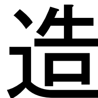
a Chinese word for CREATE

His first response was apprehension as I proceeded to disassemble the Chinese image for CREATE. It was obvious that he had never considered the etymological significance of his native language. However, as we continued, looking at words such as BEGINNING, SATAN, RIGHTEOUSNESS, BOAT, TOWER and others, his caution turned to excitement, eventually causing him to exclaim that the link between the Chinese characters and the early Genesis story “irrefutable.”